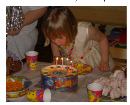
I can blow out all my candles

The afternoon party, while a great success for her, proved rather exhausting for all the grownups. History does not relate whether this was due to the natural exuberance of a wide range of three and four year olds, or because of the red wine dished out liberally to all the parents.