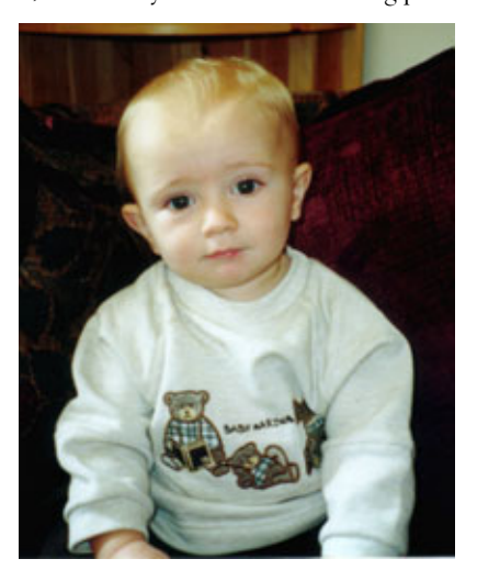
... I turn into a werebaby.