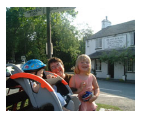
We cycled all the way up to the Drunken Duck, and boy my arms are tired.

Once both kids were installed, the entire family could enjoy some spectacular rides in North Wales and the Lake District.